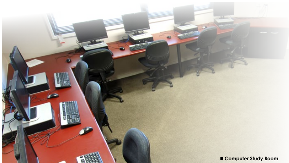
■ Computer Study Room

All bedrooms at the Newstead Residence have hardwired computer access points and the facility is also wireless networked, enabling students to use their own PC's or laptops. If a student wishes to use their own laptop they will need to contact the ICT Officer at the Newstead College to organise this.