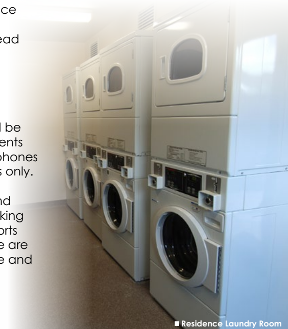
■ Residence Laundry Room

The K Mart Shopping Centre and Coles Newstead are within walking distance of the Residence. Sports facilities within walking distance are the Launceston Aquatic Centre and Launceston Sports Centre.