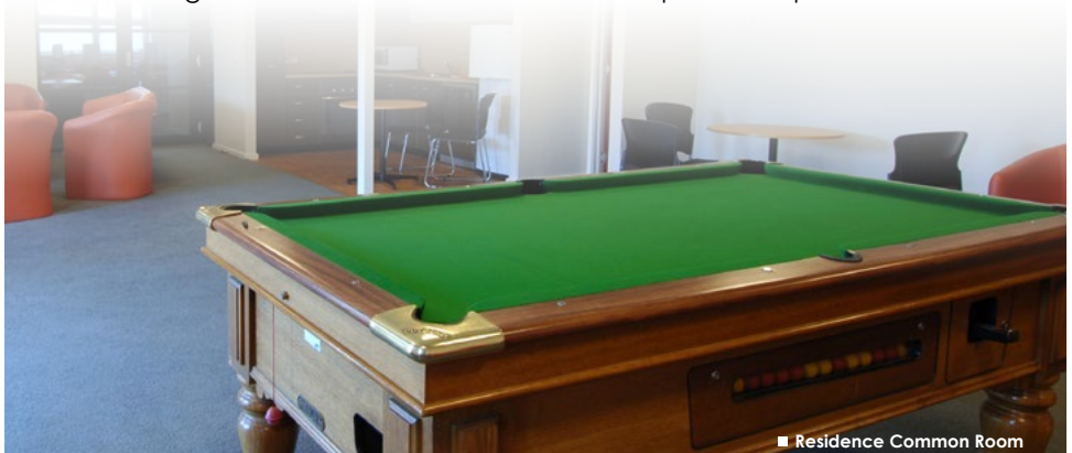
■ Residence Common Room

It is assumed that students taking up residence will display a mature and responsible attitude. Active participation in their studies including full attendance is a requirement for residency. It would be inappropriate for anyone to be taking up a place if they are not committed to their learning. The manager lives on site to assist students and provide supervision.